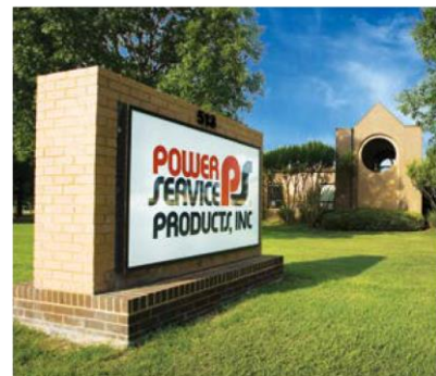
Power Service corporate offices